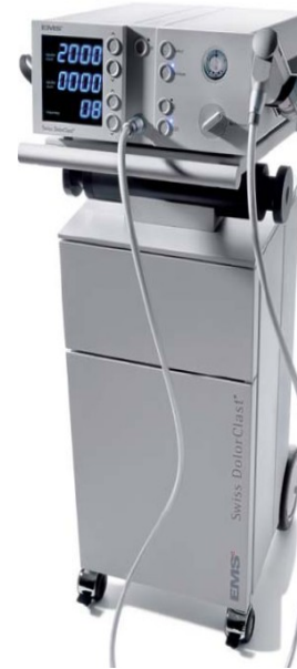
ESWT Swiss Dolorclast Method